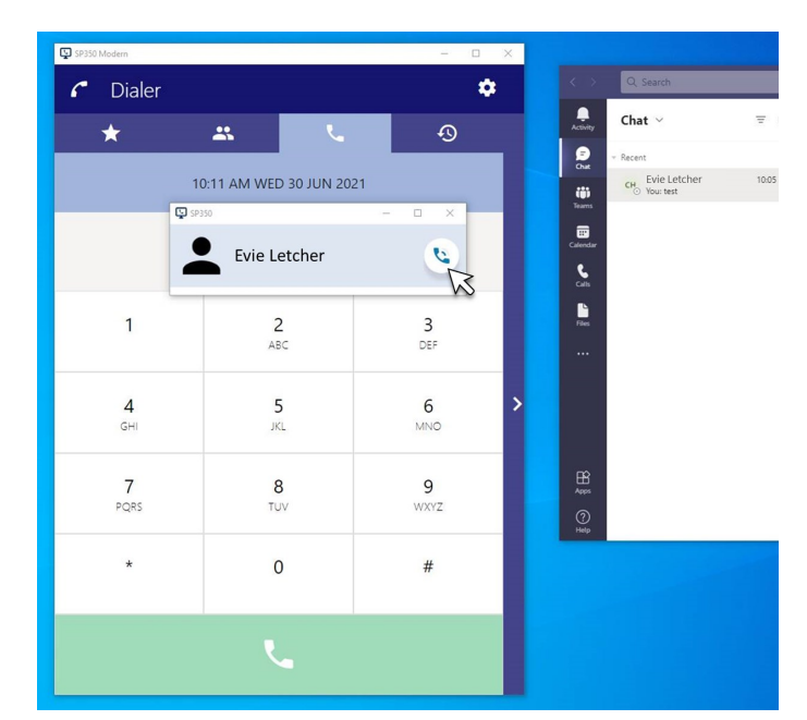
Dial from Microsoft Teams