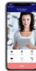
ST500 Mobile Client

*Handsets may have regional availability - check with your NEC reseller for further details