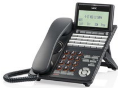
DT530 24 button