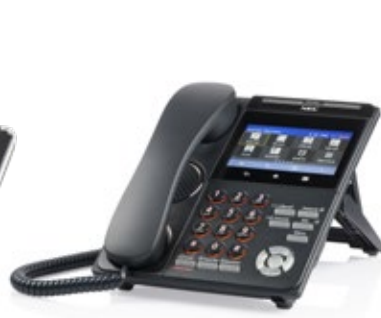
DT930 Touch Panel