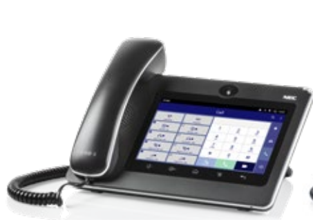
GT890 Video Phone