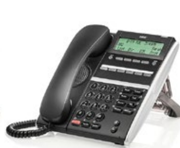
DT410 6 button