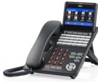
DT930 24 button